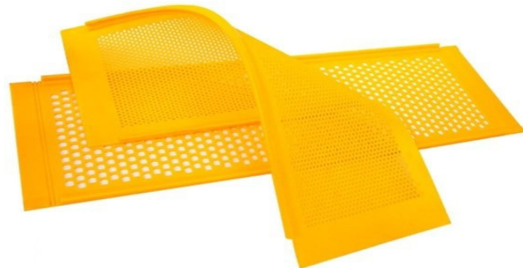
Polyurethane Screen Mats